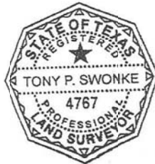
Tony P. Swonke RPLS No. 4767 July 14, 2017

THENCE North 01°25'09" West, continuing with the said newly-widened East line of Hufsmith Kohrville Road, a distance of 198.27 feet to the POINT OF BEGINNING and containing 2.844 acres of land, upon which is situated a residence whose address is 22828 Hufsmith Kohrville Road, Tomball, TX 77375.